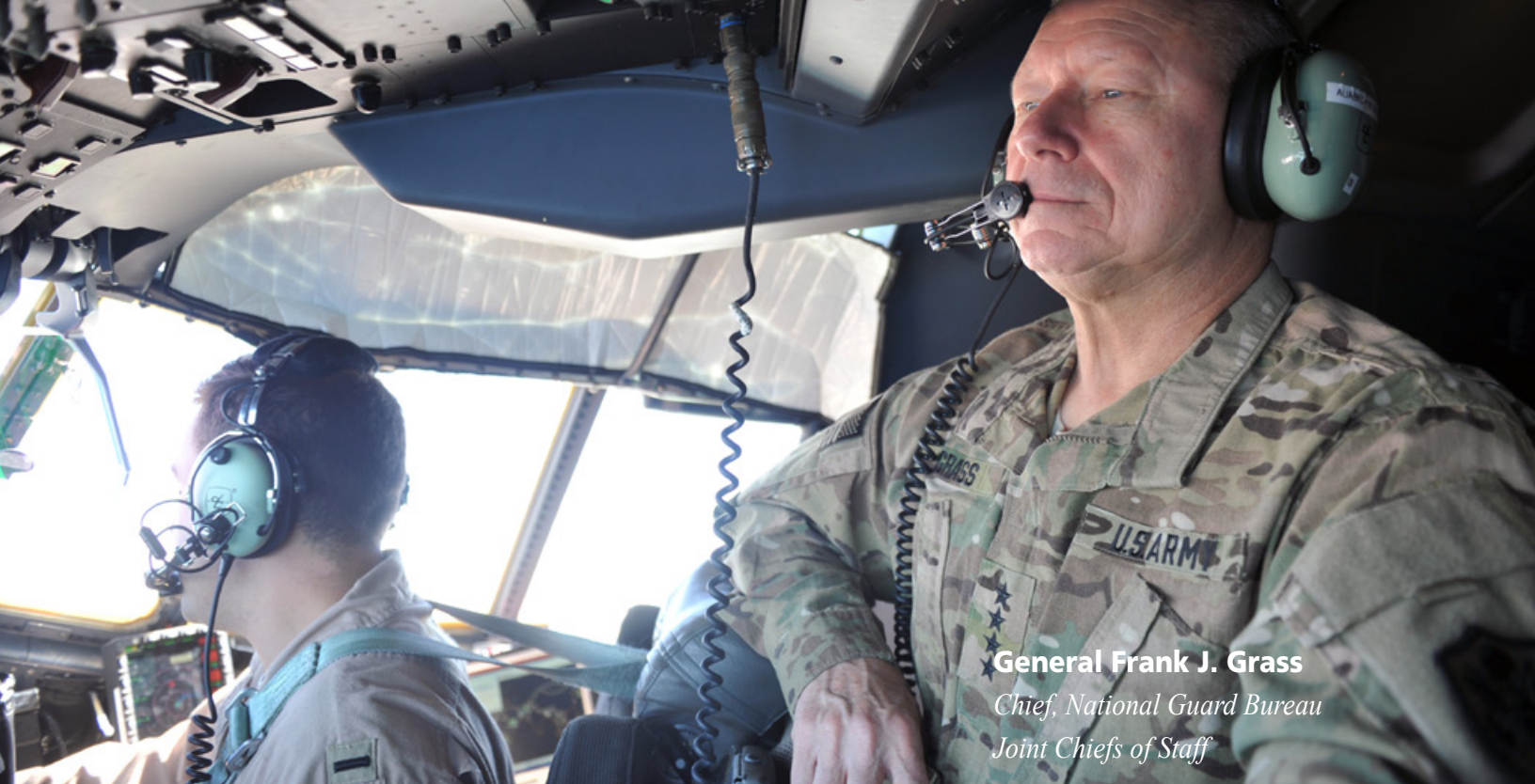
General Frank J. Grass Chief, National Guard Bureau Joint Chiefs of Staff